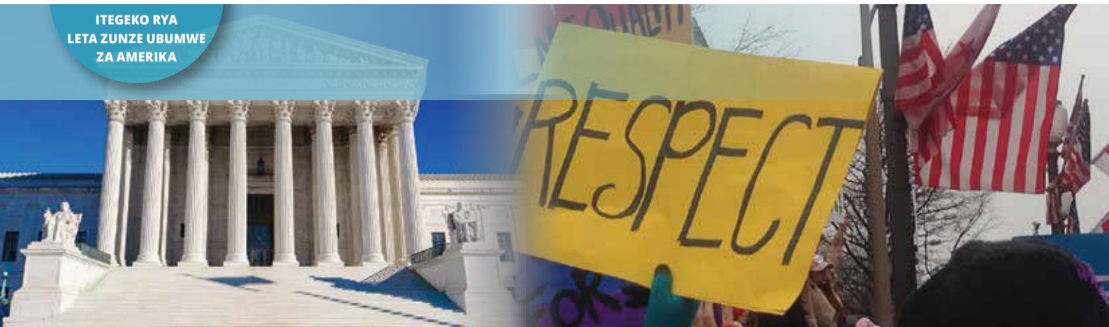
ITEGKO RYA LETA ZUNZE UBUMWE ZA AMERIKA

Ivugurura ry'Amategeko rya Mbere rivuga ko Leta idashobora kubuza umuntu gusenga mu idini rye mu bwisanzure uko iryo dini ryaba rimeze kose. Ribuza kandi Leta gukumira ubwigenge bw'umuntu bwo gutanga igitekerezo cye mu bwisanzure, ubwisanzure bw'ibitangamakuru, n'ubwisanzure bw'abantu bwo guteranira hamwe mu mahoro no kwamagana akarengane nta bwoba no gukora ibishoboka ngo ako karengane kaveho. Byongeye, Ivugurura ry'Amategeko